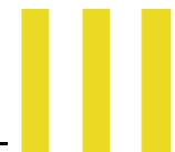
Table 2 Appin Longwalls 707 to 710 Environmental Monitoring