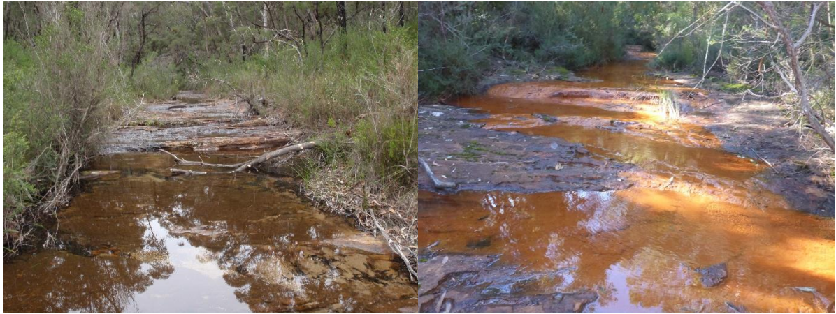
Figure 2 Flow at Pool 9 on WC17 pre-mining (left) and post-mining (right).