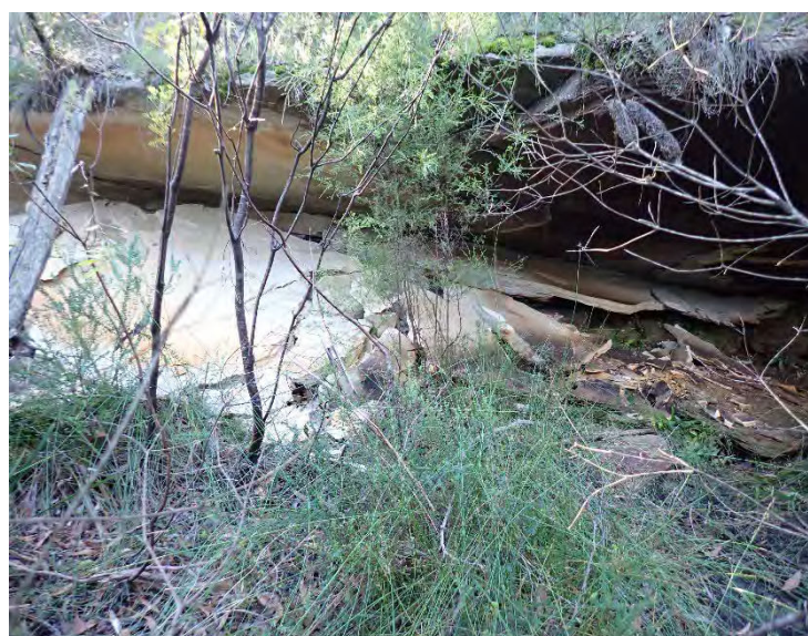
Photo 2: DA3C_LW21_016 , looking at the rockfall. Taken on 26/07/2023.