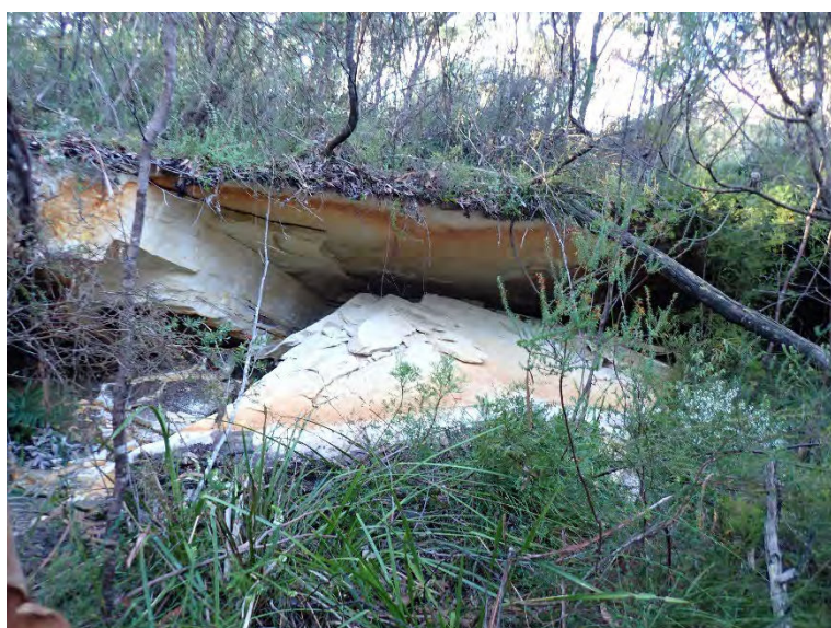
Photo 1: DA3C_LW21_016 , looking at the rockfall. Taken on 26/07/2023.