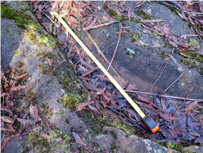
Photo 3: DA3C_LW21_017 , section of rock fracturing. Taken on 26/07/2023.