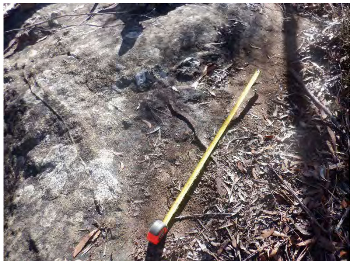
Photo 9: DA3C_LW21_018, section of rock fracturing. Taken on 26/07/2023.