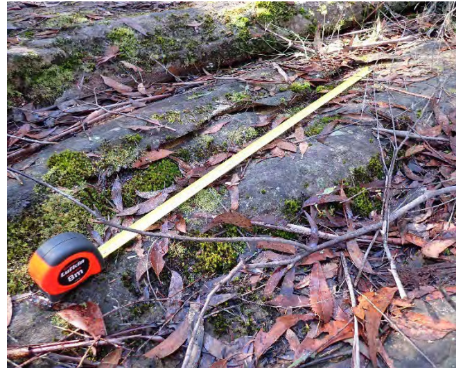
Photo 4: DA3C_LW21_017 , section of rock fracturing. Taken on 26/07/2023.