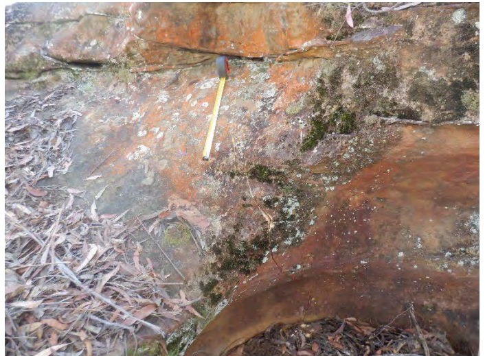
Photo 8: DA3C_LW21_018, section of rock fracturing. Taken on 26/07/2023.