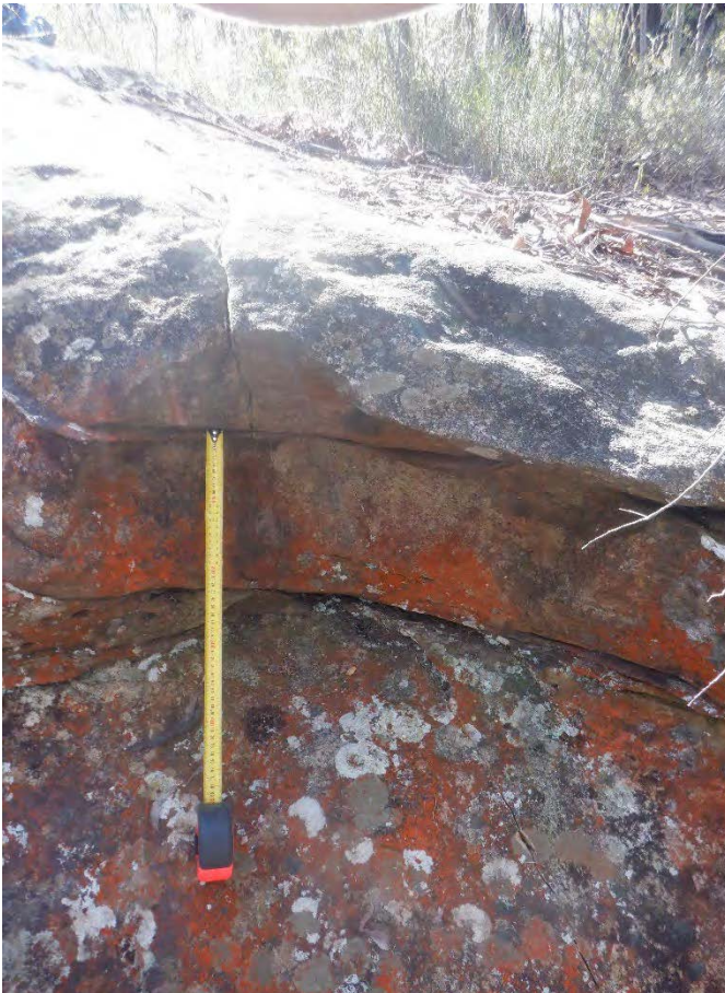
Photo 7: DA3C_LW21_018, overview of rock fracturing. Taken on 26/07/2023.