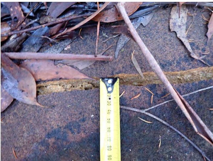
Photo 5: DA3C_LW21_017 , width of the rock fracture. Taken on 26/07/2023.