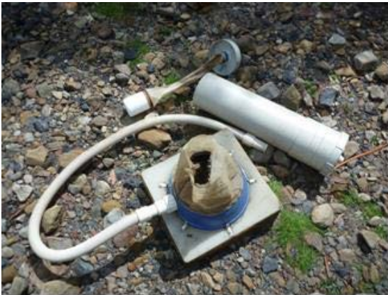
Figure 2: Example of a suction sampler

At least 5 samples will be collected from each pool to represent the different substrates. A suction sampler (Figure 2) described by Brooks (1994) will be placed over the substrate and operated for one minute at each sampling location. The sample is washed thoroughly over a 500- \mu m mesh sieve. All material retained on the 500- \mu m mesh sieve is preserved in 70% ethanol for laboratory sorting. This method has been used extensively by NSW Office of Water.