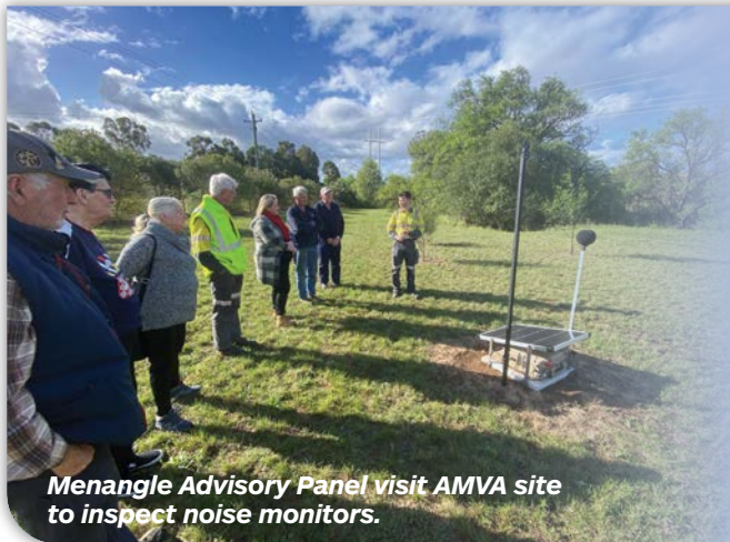
Menangle Advisory Panel visit AMVA site to inspect noise monitors.

Subsidence Advisory will then provide advice on the claim's lodgement process. Under the Coal Mine Subsidence Compensation Act 2017, you have 12 months from when you first notice any damage to lodge your claim to be eligible for compensation.